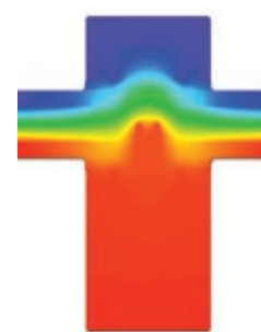
Thermal cross section: Less heat loss indicated by the red colour